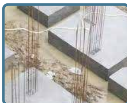
Concrete Repair, pilecap Encapsulation Repair System