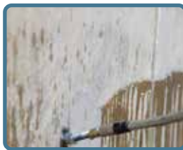
Permenant Solutions For Water Leakage Injection System