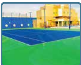
Sports Flooring System, Cycle Track, Tennis Court etc