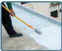
Complete Water Proofing Solutions basement 2 Terrace