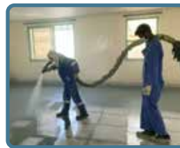
combo roofing polyurea Coating and grp lining System