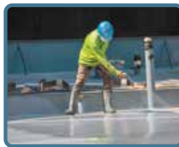
V and Rust Protection Coating, Thermailate