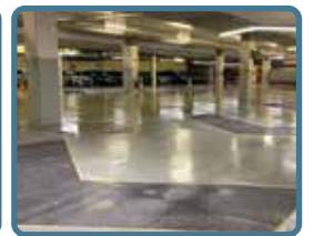
Epoxy flooring,car park system, Industrial and Protective coating