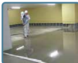
Floor Hardening and self leveling