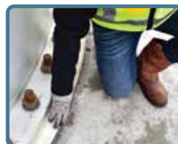
Epoxy and cementitious Grouting Especially in the oil Field sector