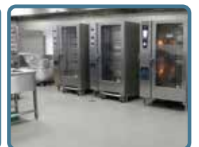
Epoxy Heavy Duty screed and PU screed for Hotel kitchen